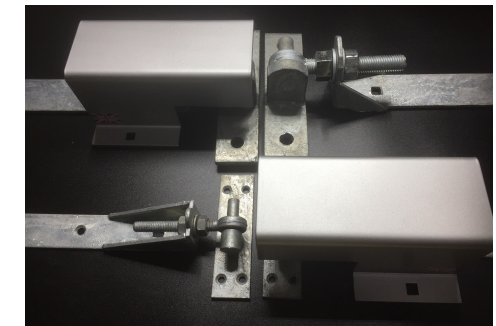
CHOOSE LEFT OR RIGHT OR RIGHT HINGED