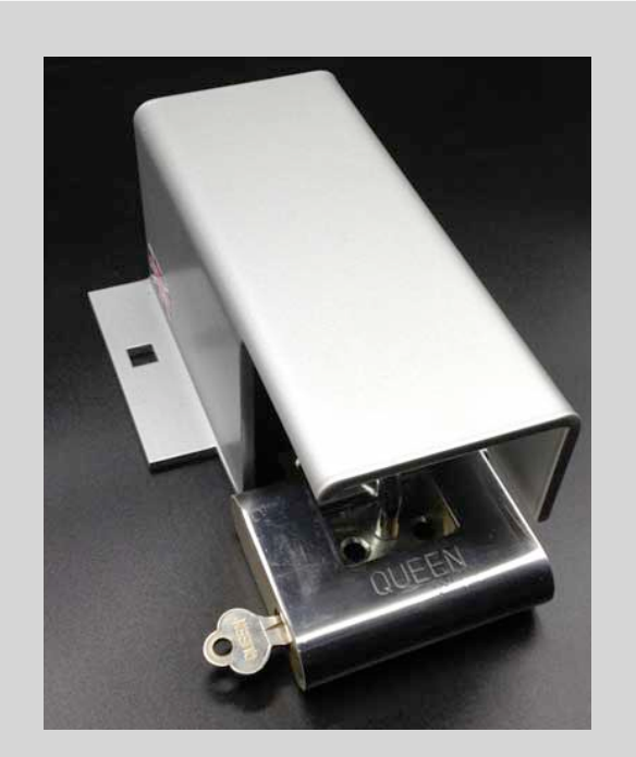
MK7-T RIGHT SIDE ANTI LIFT SHACKLE, HASP & STAPLE COVER