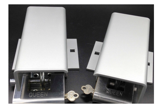
CHOOSE LEFT OR RIGHT HINGED