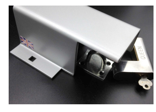
MK7-T RSA SHACKLE, HASP AND STAPLE